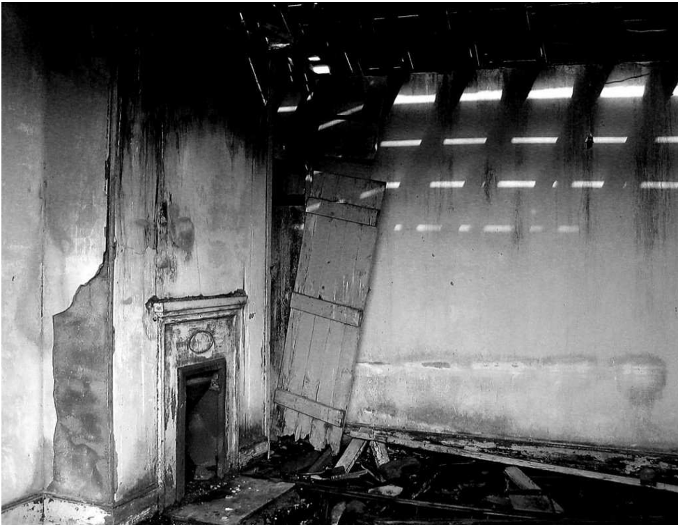
What Once Was Home

Whether we take them to intentionally document something, or whether they are simply family snapshots, the photographs that we take today will form part of the collective memory in years to come.